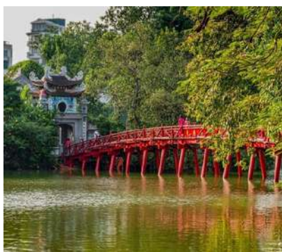
Ngoc Son Temple

Halong –Hanoi: 165km => 4 hour transfer included breaktime on the way